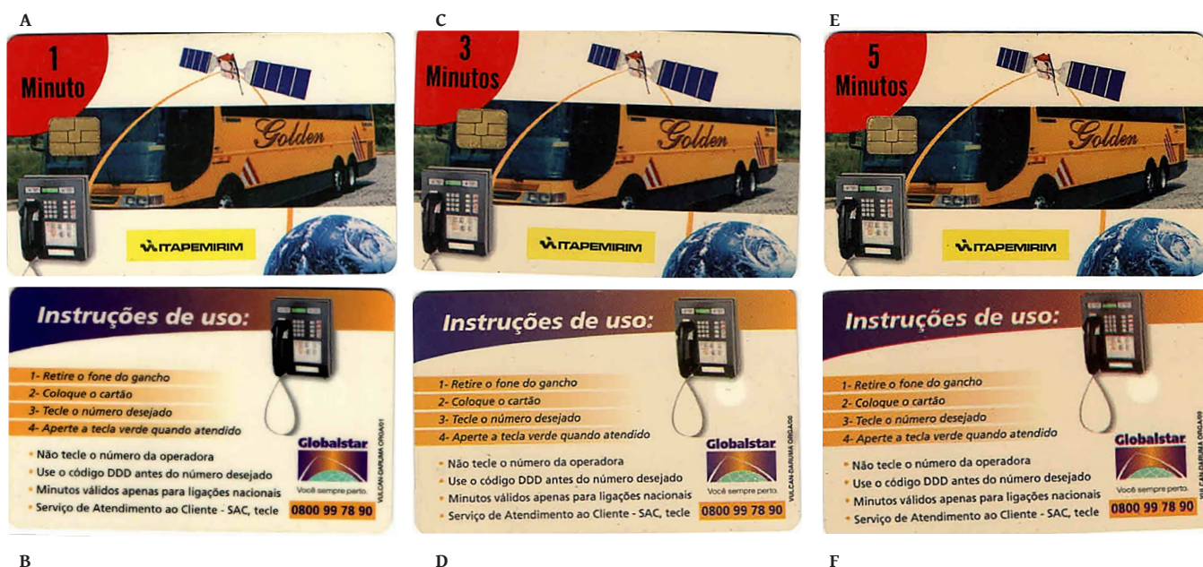
Fig 4. Specific phonecards (front and respective backside) used in payphones of Viação Itapemirim S.A. transport company buses, model Golden.